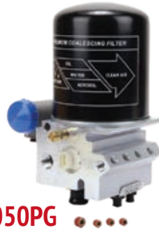
PRO5004050PG OE: BW R5004050