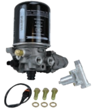
PROR955205 OE: TDA R955205