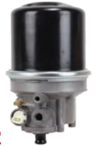
PRO065612 OE: BW R109477