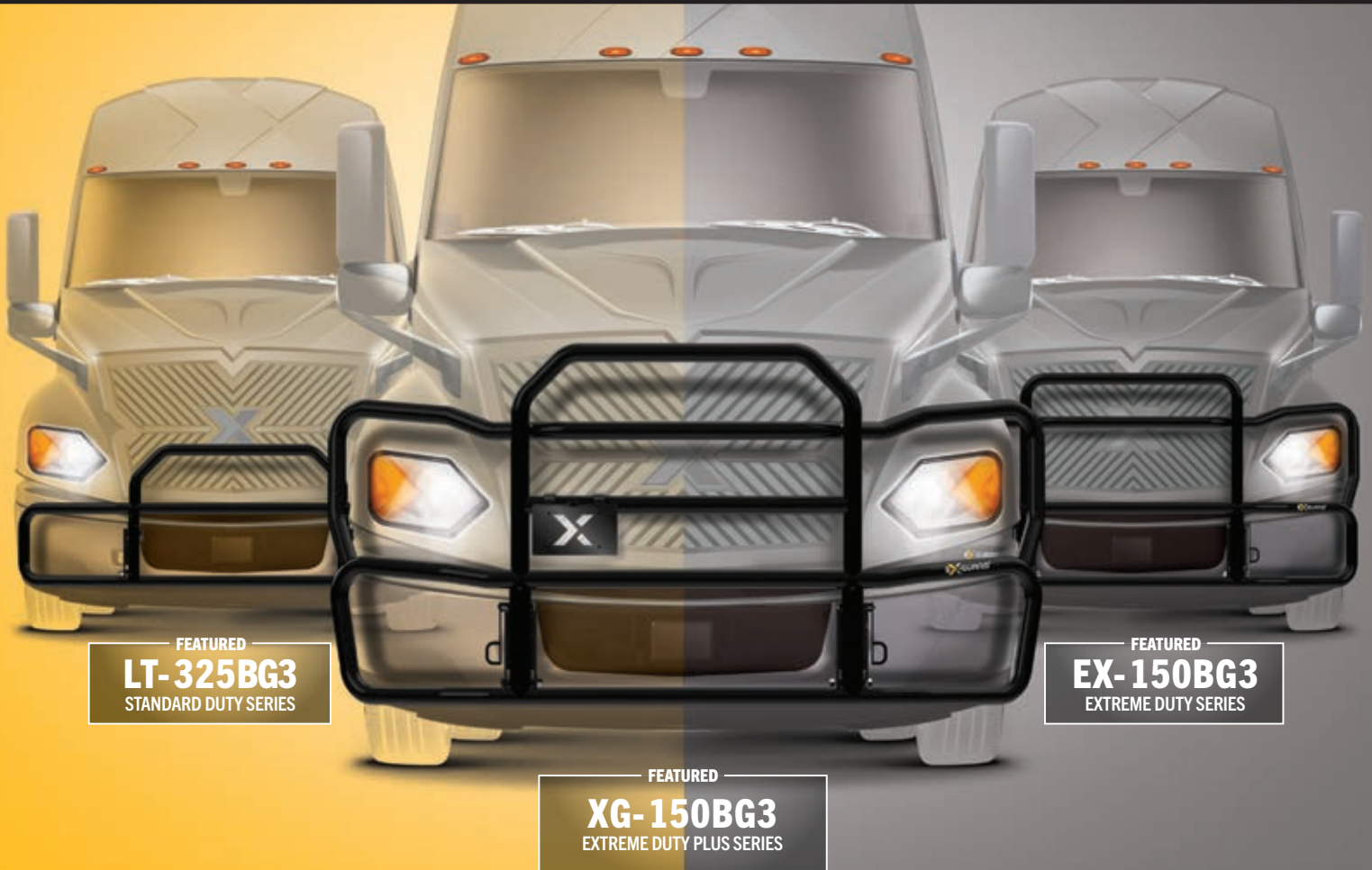
FEATURED LT-325BG3 STANDARD DUTY SERIES