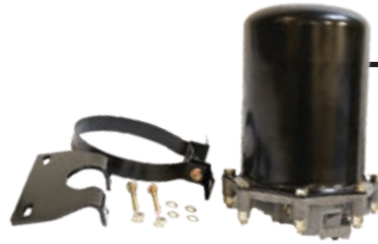
PRO065225 OE: BW R109685